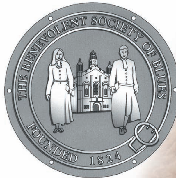
The BSB Shoulder Plate

DATA PROTECTION: The BSB is registered under the Data Protection Act 1998, Registration No: Z6342912. Unless you request to the contrary your personal details may be passed to other parts of the Christ's Hospital community.